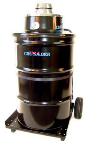
Utility Series H.E.P.A. 55 gallon drum adapter with optional #8055-CART 55 gallon cart shown above.