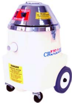
10 gallon Premium Series H.E.P.A. Vacuum shown above. Also available in the Utility Series.

We have a large assortment of tools, attachments, and hoses available. Please see our vacuum tools and accessories literature or our website for more information.