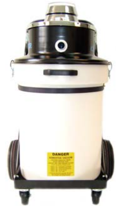
30 Gallon Utility Series H.E.P.A. shown above.