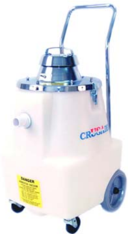
15 gallon Utility Series H.E.P.A. Vacuum shown above. Also available in the Premium Series.