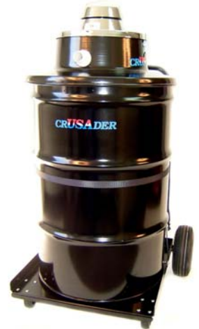
Utility Series H.E.P.A. 55 gallon drum adapter with optional #8055-CART 55 gallon cart shown above.