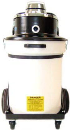
30 Gallon Utility Series H.E.P.A. shown above.