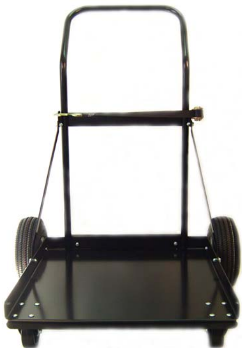
#8055-CART 55 Gallon Cart

All models come with the Crusader Standard Warranty