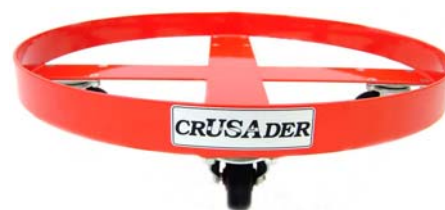
#4077 55 Gallon Drum Dolly

For use with your existing powerhead, float cage assembly, filter bag, and hose from your 15 or 30 gallon vacuum