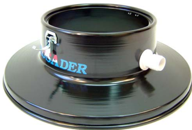
#8055A Drum Adapter Only

The 55 gallon cart is made of heavy duty powder coated steel and is much more sturdy than a standard drum dolly. It features 10" pneumatic wheels and 4" heavy duty extra wide front casters for easy maneuverability across rough terrain.