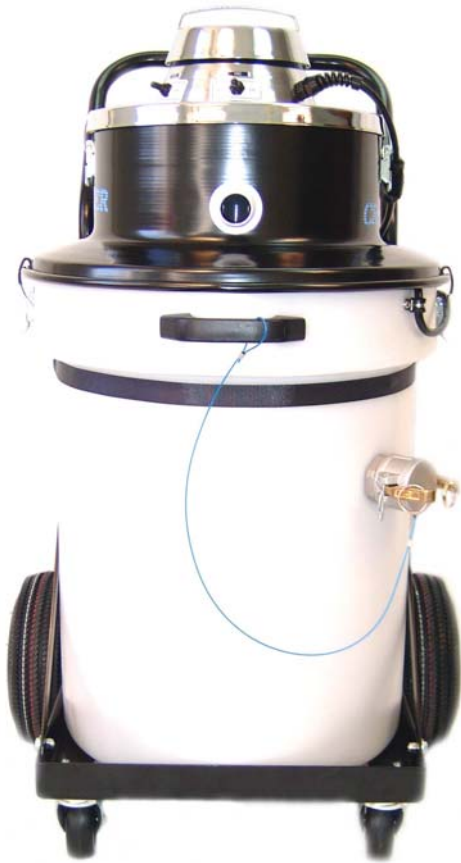
M1050-30-PUMP Shown above

The Crusader 30 Gallon Continuous Pump-out Vacuum is great for pumping outside or to a drain while you continue to work inside. This vacuum can pump while you vacuum, or can pump when your done vacuuming. The pump-out vacuum is great for pumping down one or more flights of stairs instead of trying to wheel a vacuum tank full of heavy liquids down a stairs. Save on workers compensation from employees hurting their backs while lifting heavy containers full of liquids - PUMP IT OUT!